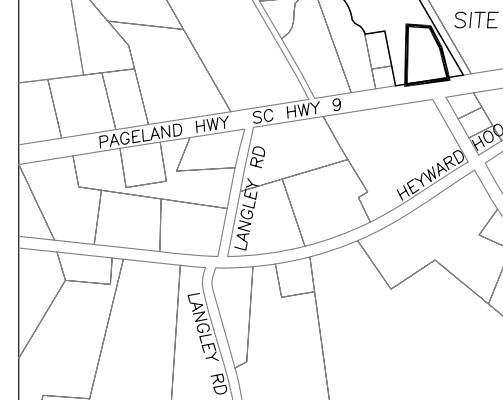
VICINITY MAP (1"= 1000')

FRONT BUILDING SETBACK LIMIT AT 130' MIN LOT WIDTH