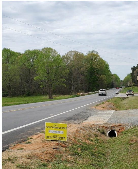
Facing West on Pageland Highway