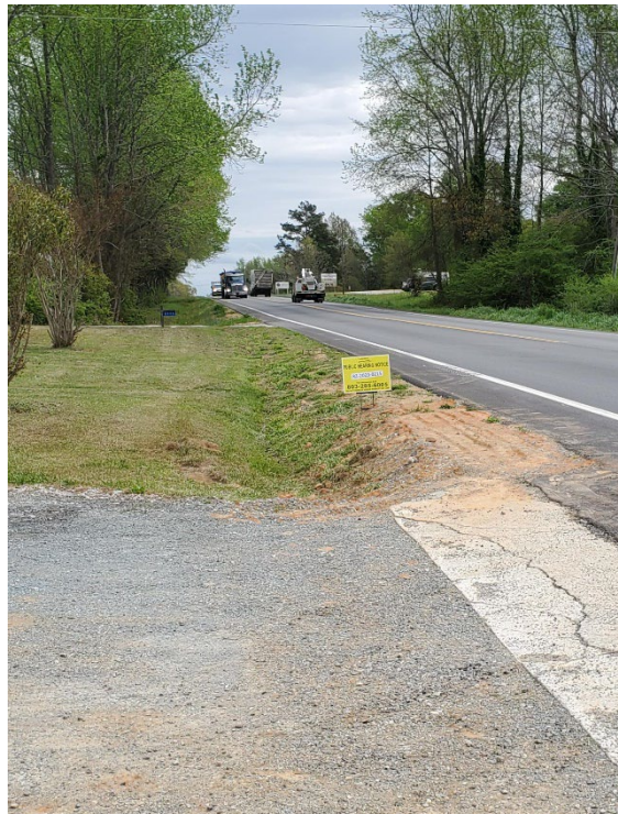
Facing East on Pageland Highway