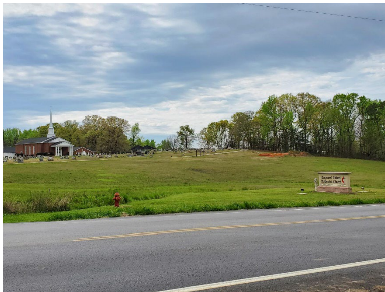
Facing Out from Subject Parcel, Looking South Across Pageland Hwy