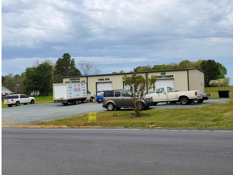
facing North on Pageland Highway- business on site at 3867 Pageland Hwy